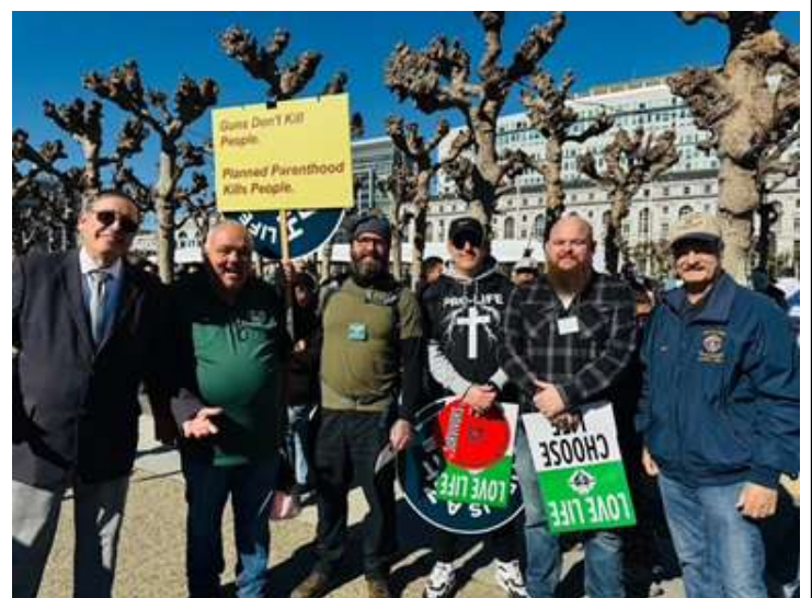
Brother Knights from Sacramento