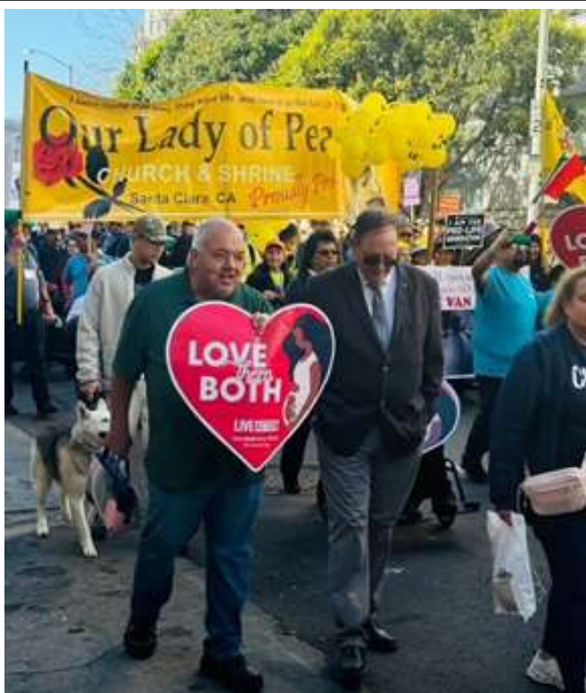
State Secretary and State Deputy