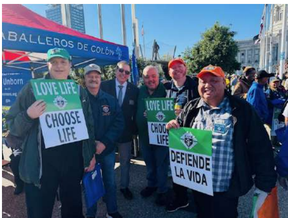
San Francisco Knights