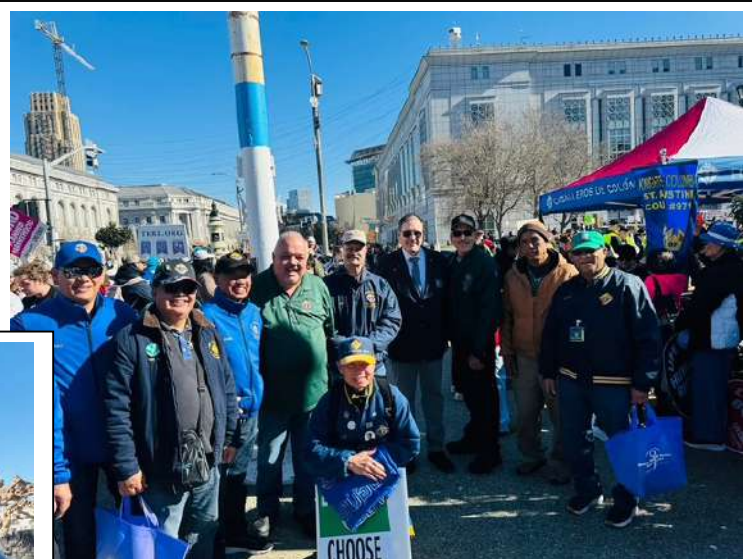
Filipino council from South San Francisco