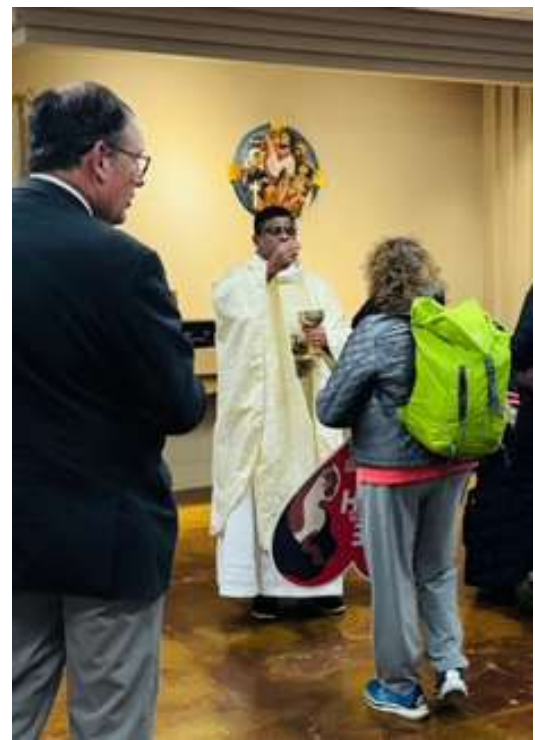
Early morning Mass